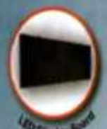
LED Display Board