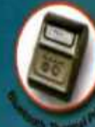
Handheld Thermal Printer